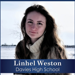
Linhel Weston Davies High School