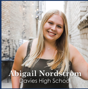
Abigail Nordstrom Davies High School